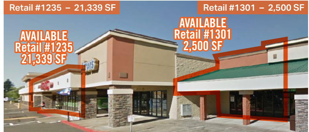
Retail #1301 - 2,500 SF