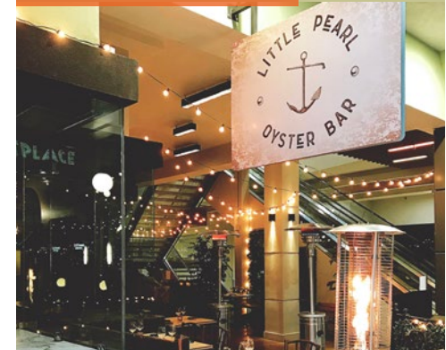
Little Pearl Oyster Bar