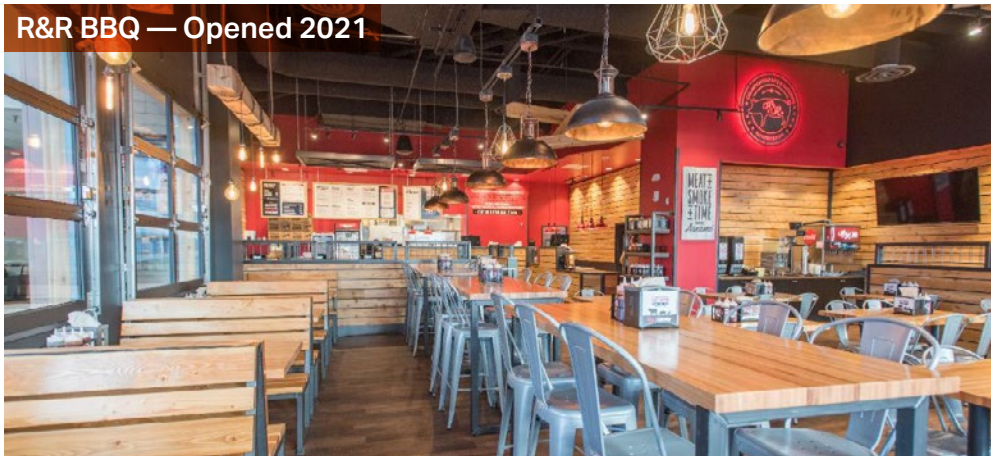
R&R BBQ — Opened 2021