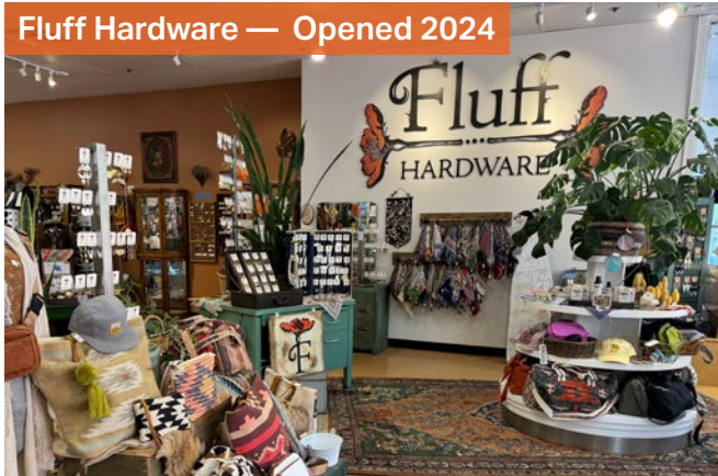
Fluff Hardware — Opened 2024