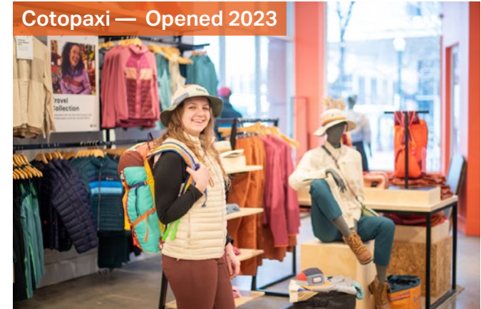
Cotopaxi — Opened 2023