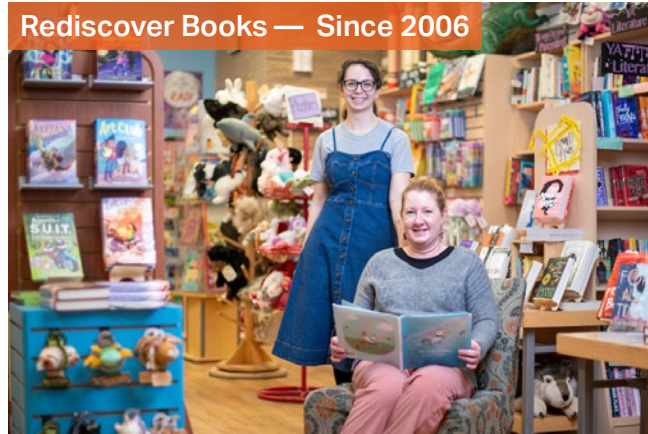
Rediscover Books — Since 2006